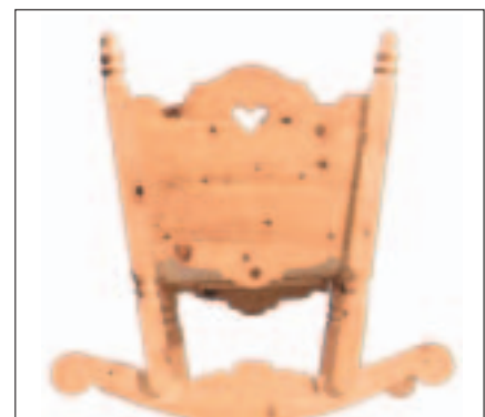
Simple sanding of curved pieces