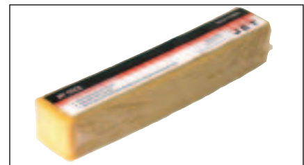
Abrasive cleaning stick